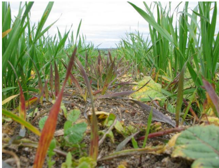
Brome Grass control with Midas herbicide 4 weeks after application