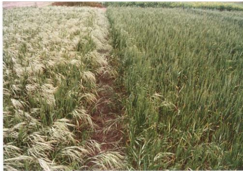
Brome Grass control with Midas herbicide 14 weeks after application